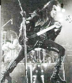
Gene taunts the crowd with his #1 Gibson Grabber at a KISS show in the fall of 1975.

very bizarre. It had the boomy lows, but with high end. Towards the end of recording Wicked Lester, Steven Stills was at the same studio doing his solo record. He heard the sound of that bass and fell in love with it, and gave me $300 for it. I remember originally paying $150 for it, so I thought boy, I'd made a killing.